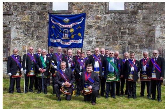
The office bearers of Lodge 236 outside the old store